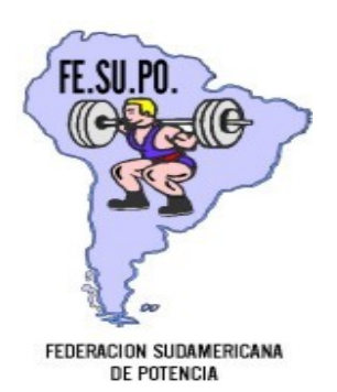
South America 2013 report

The year of 2013 was amazing for FESUPO and South America!